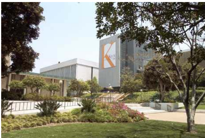
University of California Keck School of Medicine Los Angeles, California U.S.A.