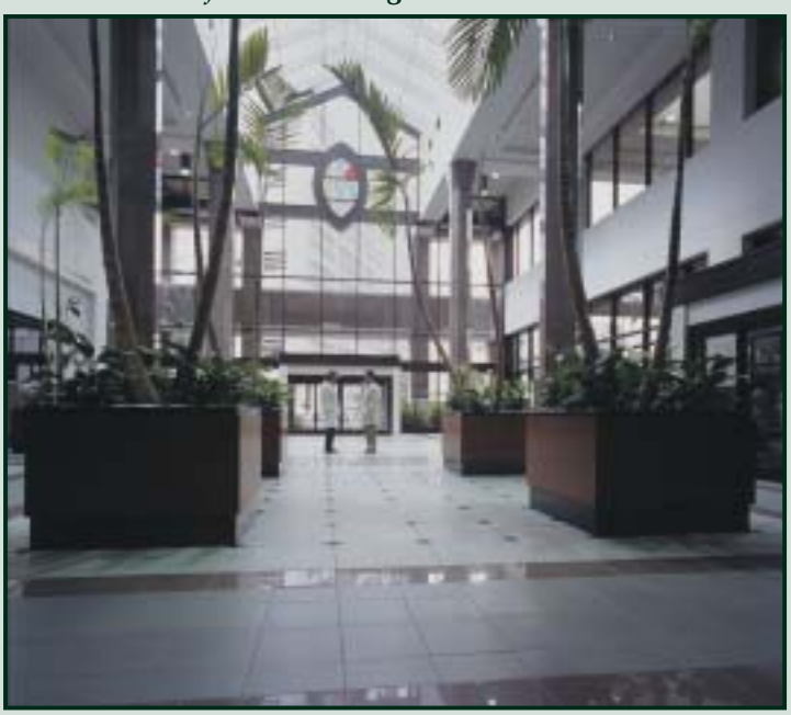
July 10-13, 2004

Tulane University School of Medicine New Orleans, Louisiana U.S.A.